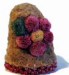
Leather Thimble from the N.W.T. with tufted moose hair decorations.